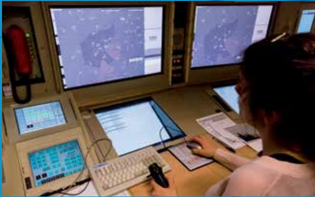
ERATO Controller Work Position in Brest ACC