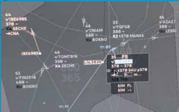
ATCO's screen with ERATO