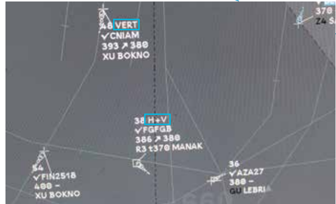
H+V Divergence in the horizontal and vertical planes from the assigned trajectory