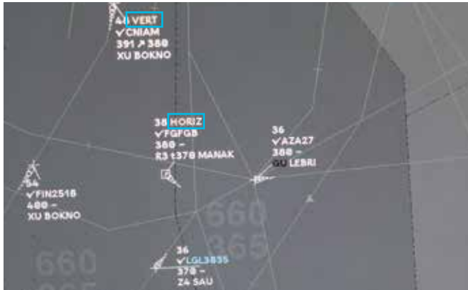
VERT Divergence in the vertical plane from the assigned trajectory

ERATO highlights flights that diverge from their ATC assigned trajectories.