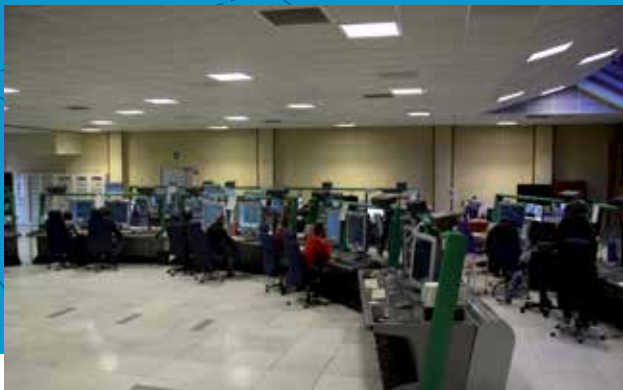
Brindisi ACC: Operations room

Live trials in France and real-time simulations in Italy have demonstrated significant benefits that ERATO can bring in terms of safety and capacity.